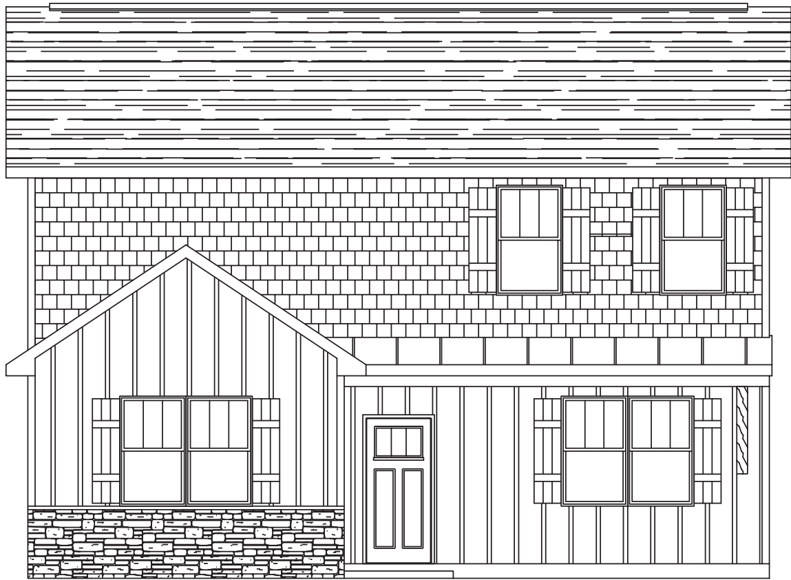
Photo may show elements not currently offered. See Agent for details.